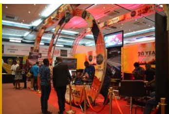
HomeBoyz Entertainment celebrate their 20 th Anniversary.